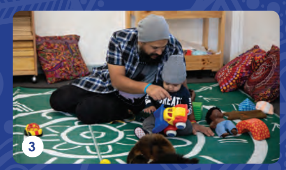
Boorai touches the wheels and makes sounds. Dad: You like the wheels don't you?