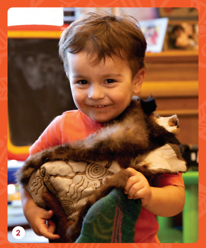
Dad: You look cosy! Possum skins keep our Mob nice and warm don't they? Boorai: It's soft.