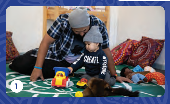
Dad: What are you playing with? Are you driving the truck? Boorai picks up truck and makes sounds.