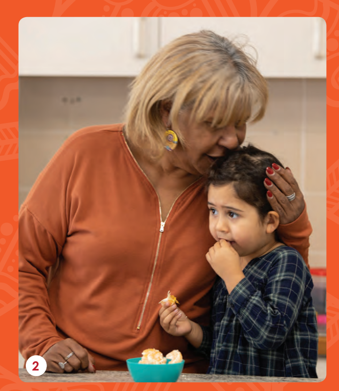
Nan: Aw I'm glad you like it.