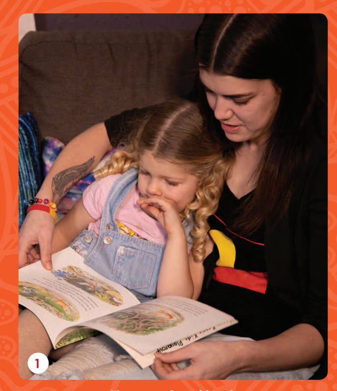
Mum reads out loud.