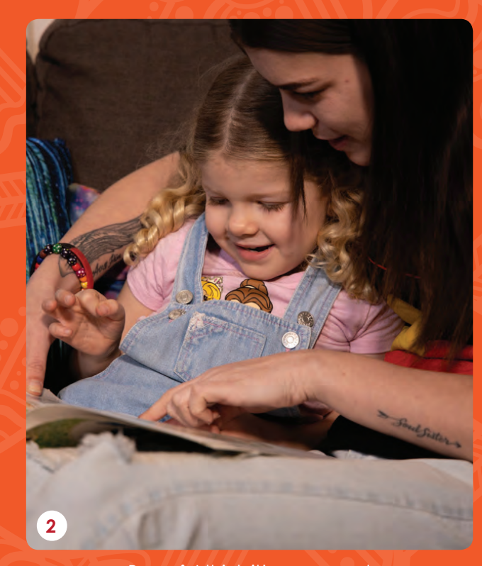
Boorai: I think it's a possum!

Mum: That's right Dort, it's a funny little possum isn't it? What's the possum doing?